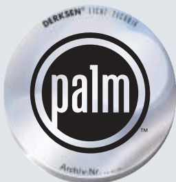
Example: Category 1

Your artwork is lasered into the chrome plated glass and into dichroic colour filters. We are capable of meeting the tightest schedules.