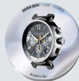
Example: Category 4