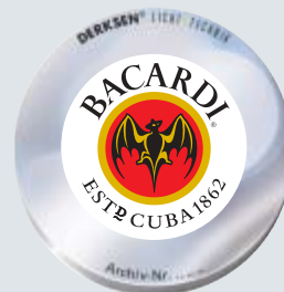
Example: Category 3/2