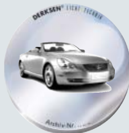
Example: Category 2